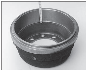
2. Width of braking surface