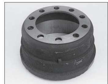
7. Are there slots in the back of the drum for wheel spoke clearance?

CALL YOUR LOCAL PBS STORE WITH THESE MEASUREMENTS