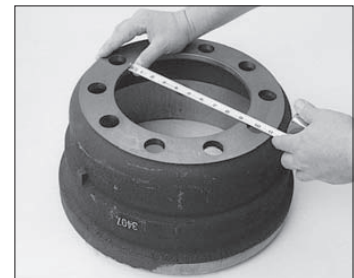
4. Pilot diameter