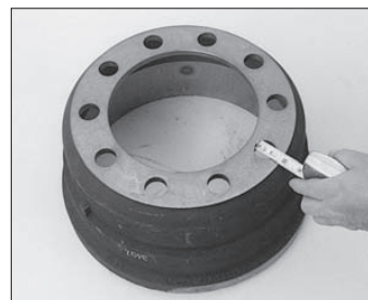
6. Number, size, and location of bolt holes