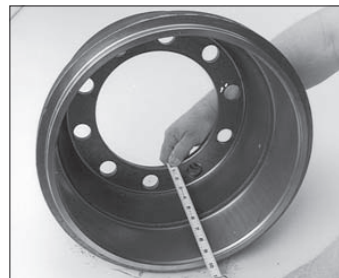
3. Overall depth of the drum