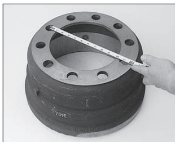
5. Bolt circle diameter